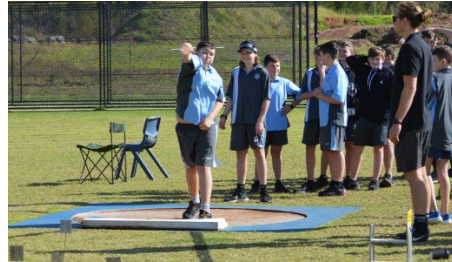
Some recent Athletics Carnival photos