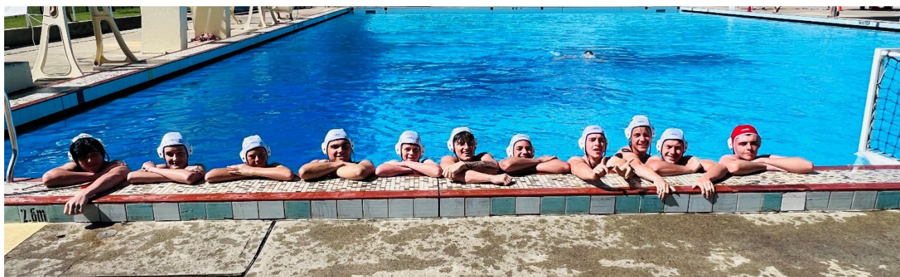
Our boys water polo team